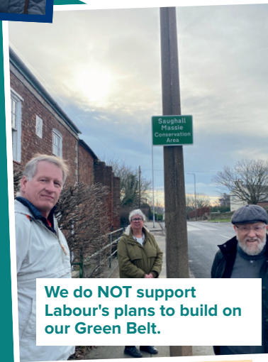
We do NOT support Labour's plans to build on our Green Belt.

However, soon after the election, Labour more than doubled the Council's housing target. Labour is demanding 35,000 houses - and is loosening protections on the environment.