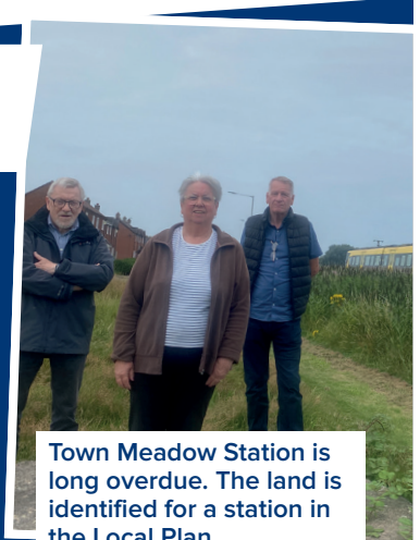
Town Meadow Station is long overdue. The land is identified for a station in the Local Plan.

The station is included in the Council's Local Plan but, so far, we've only heard about plans for a station at Woodchurch. We will be meeting Merseytravel soon and will report back soon.