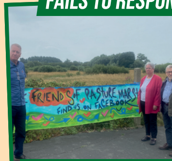
We are supporting calls for pasture marsh to be retained for local wildlife.

We asked the Council Leader to remove the council-owned land from sale for development. Sadly, she never replied.