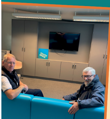
The new Youth Hub in Moreton Library follows a campaign by residents

While Labour Councillors pumped more cash into youth services in central Birkenhead, places like Moreton lost out.