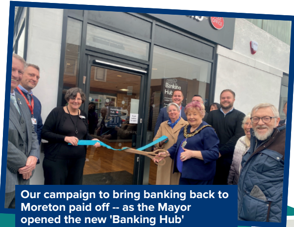
Our campaign to bring banking back to Moreton paid off -- as the Mayor opened the new 'Banking Hub'

If you need our help on any local issue, you'll find our details on the back page of this leaflet.