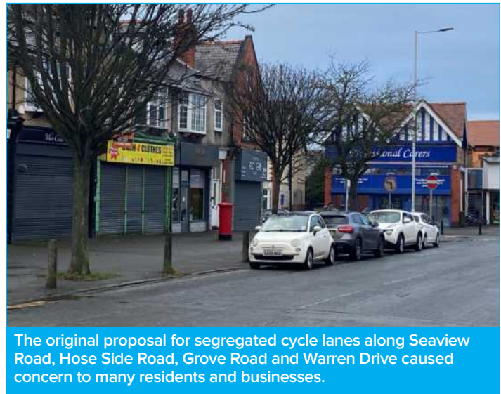
The original proposal for segregated cycle lanes along Seaview Road, Hose Side Road, Grove Road and Warren Drive caused concern to many residents and businesses.

You can also email birkenheadtoliscard@wirral.gov.uk or call the council's call centre on 0151 606 2000 (9am to 5pm Monday to Friday) to speak to a member of staff for details.