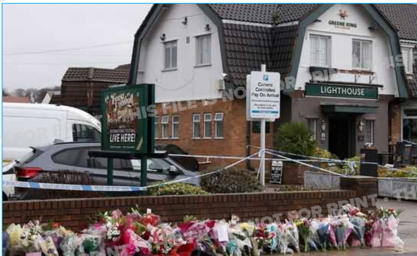
Merseyside Police received more than 150 pieces of intelligence in the first 10 days after the shooting but are appealing for more.

Or, if you prefer, call 0151 649 1859 for help now or visit www.insightiapt.org