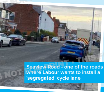
Seaview Road - one of the roads where Labour wants to install a 'segregated' cycle lane

Ian, Lesley and Paul will write to those living along the route when we have details of this.