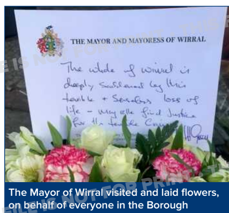
The Mayor of Wirral visited and laid flowers, on behalf of everyone in the Borough

In December, 11 people were sentenced to a total of 38 years in prison for their part in an organised crime group linked to large-scale drug supply in Wirral.