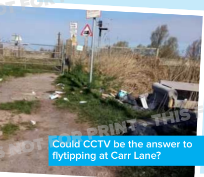
Could CCTV be the answer to flytipping at Carr Lane?

Often this is commercial or industrial waste dumped and left for the council to remove.