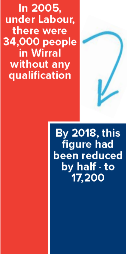
Source: Office for National Statistics, Labour Market Statistics, December 2018

The new Careers Hubs follow news that the number of people in Wirral without any qualification has been reduced by half since 2005.