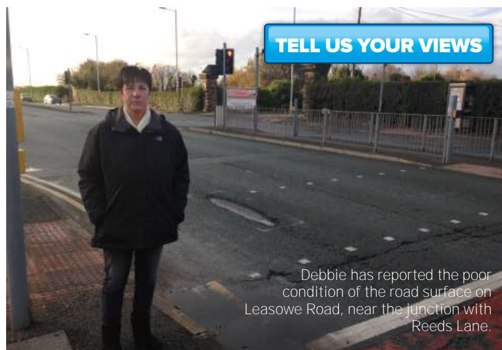
Debbie has reported the poor condition of the road surface on Leasowe Road, near the junction with Reeds Lane.

If your road has a pot hole, let Debbie know! Use the contact details on the back page or www.wirraconservatives.com/potholes