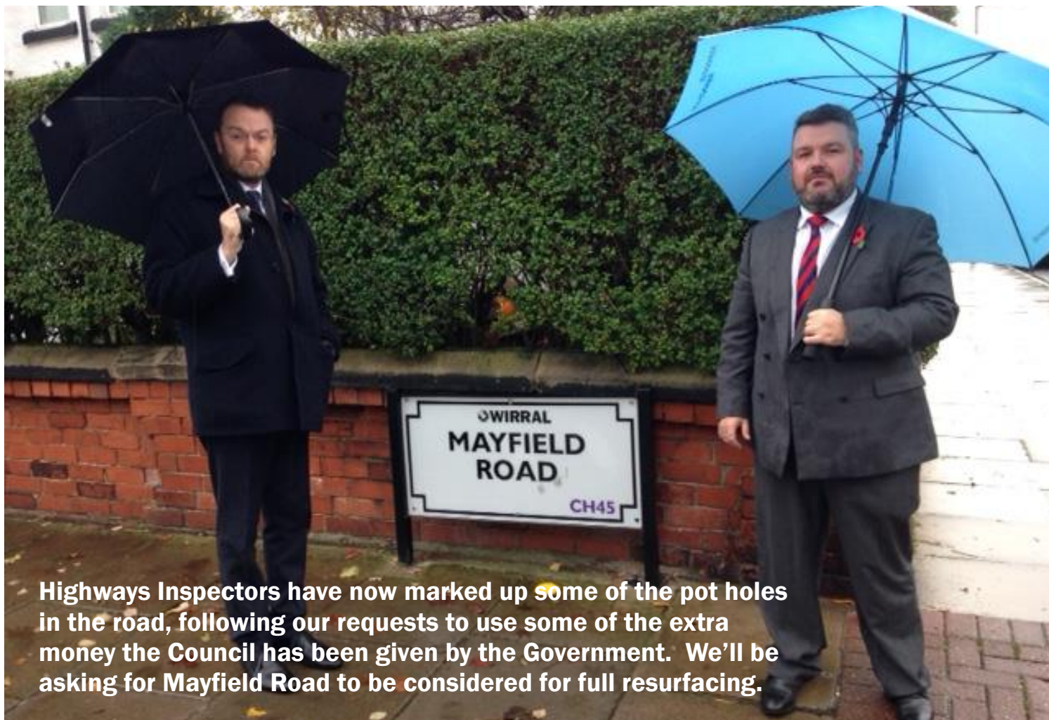
Highways Inspectors have now marked up some of the pot holes in the road, following our requests to use some of the extra money the Council has been given by the Government. We'll be asking for Mayfield Road to be considered for full resurfacing.

Mr P in Clarendon Court isn't happy at the fumes from taxis standing idle on the taxi rank. The evidence proves he's right - this road exceeded the national air pollution limits. As a result, vehicles left idling can now be fined £20. We've asked the Town Hall's Licensing Department how many have been!